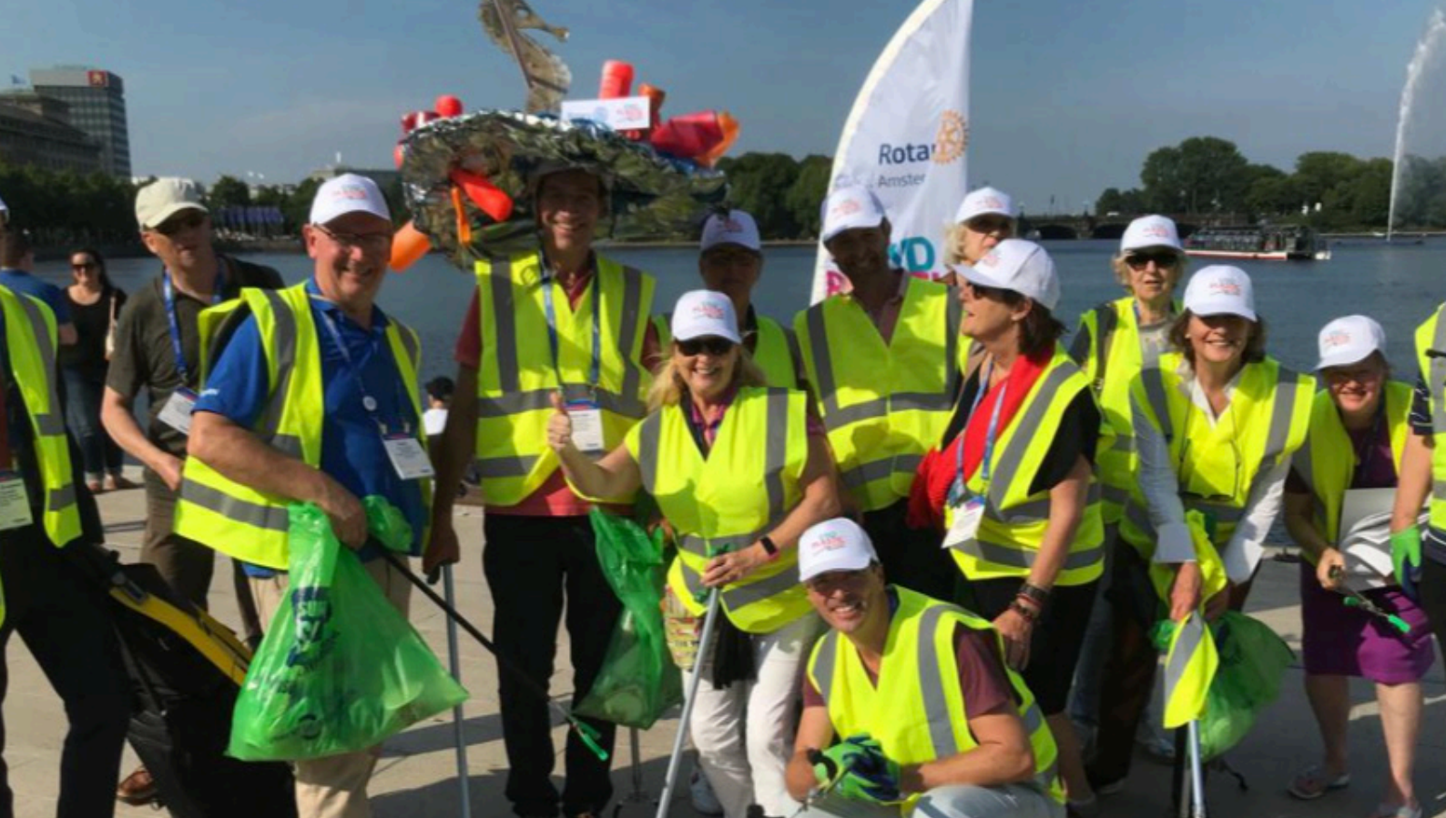
EndPlasticSoup in action - Rotary International Convention Hamburg June 2019