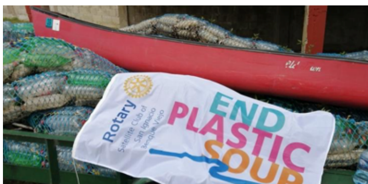
EndPlasticSoup represented in Belize

We created Action packages for clubs: School challenge, Sport challenge, Event & meeting challenge, Shop & Restaurant challenge, and River, Lake, Bay & Beach Cleanup and Adoption. These packages are also available in 3 languages English, German, Dutch, while Spanish is currently being translated.