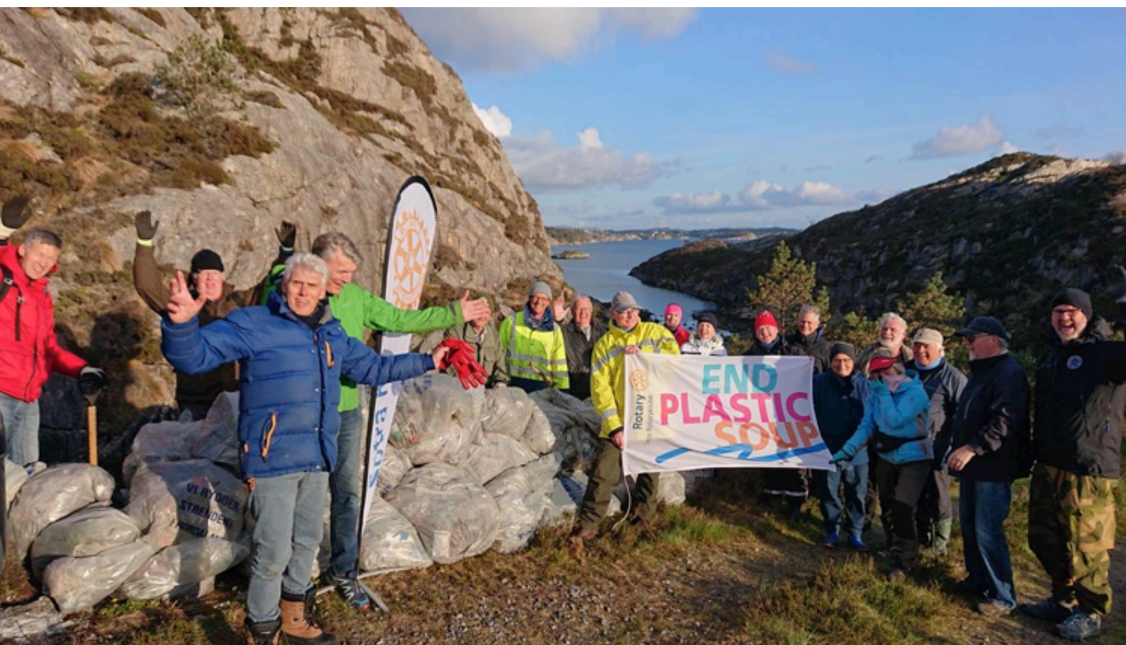
First EndPlasticSoup Ambassador and Member Club RC Sotra, Norway